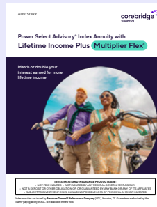
Lifetime Income Plus Multiplier Flex ®