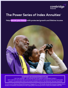
Index annuity educational client brochure

Power Select Advisory (click to download)